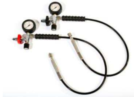
Filling device PN200 (black) and PN300 (red)