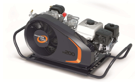
PE200-TB with handles

The optional carrying handles allow easy and comfortable transport.