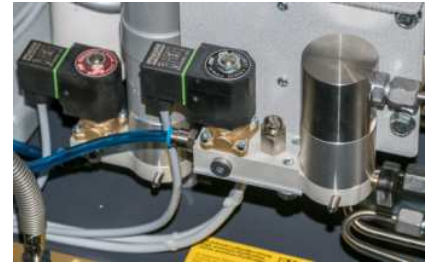
B-DRAIN automatic condensate drain system

OPTION: Condensate collecting tank 10 litre, about 5 litre capacity, for the environmentally friendly disposal of the condensate