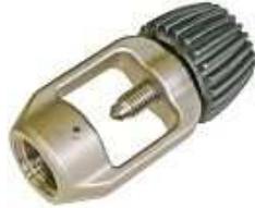
International filling connector