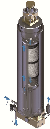
Purification System P21/350