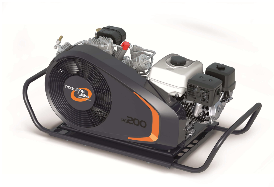
PE200-TB with carrying handles (optional equipment)